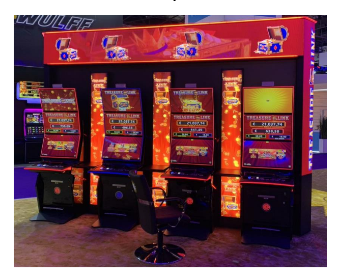
Full Led fillers + LED sign