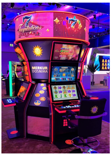
Custom circle fillers